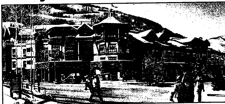
One Willow Bridge Road, a $100 million condominium development under way in Vail, will incorporate the latest in technology.

The "tech generation" will be right at home in a luxury condominium development to be delivered in Vail this fall.