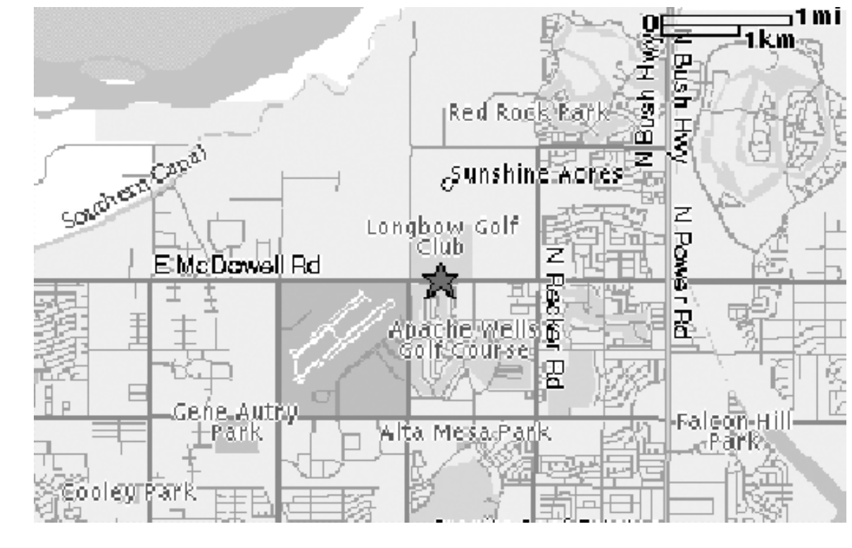
Site Vicinity Map